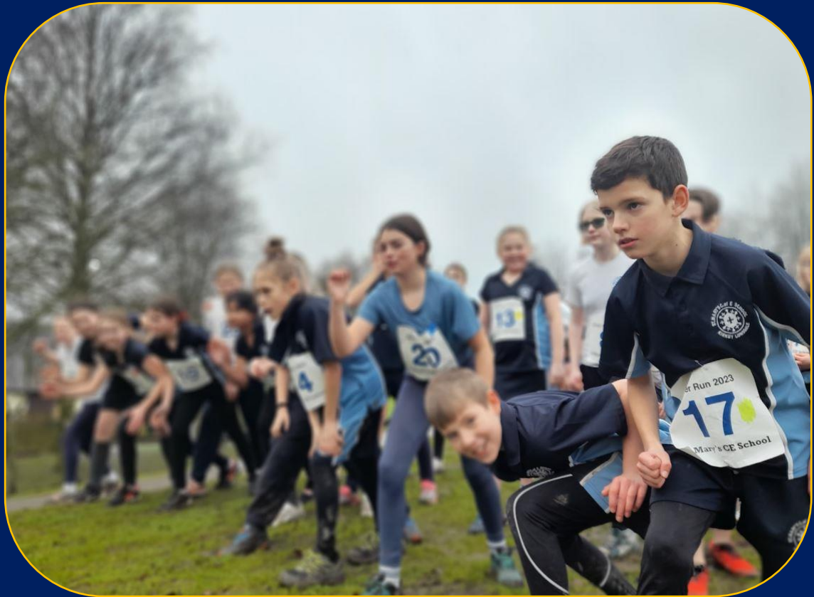
Winter Run 2023

Church of England Primary School Kirkby Lonsdale