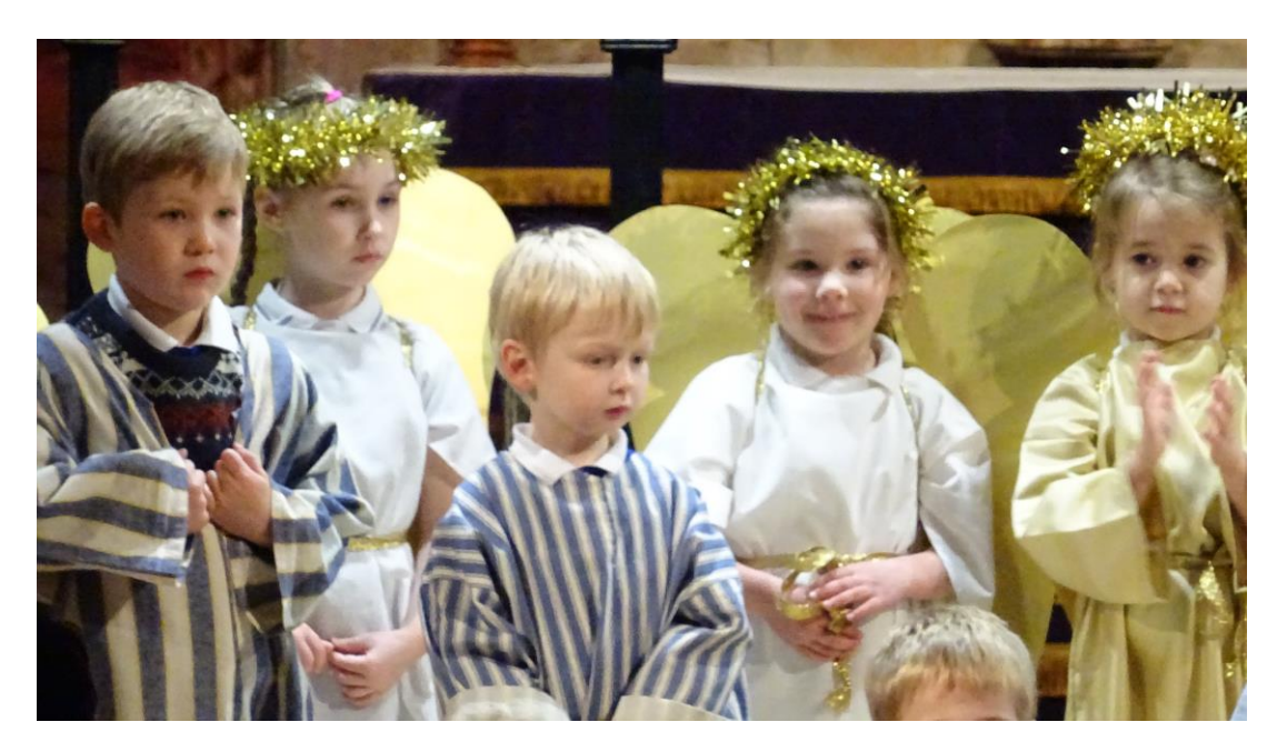
Term ends on 15th Dec at 3:10 and 3:15