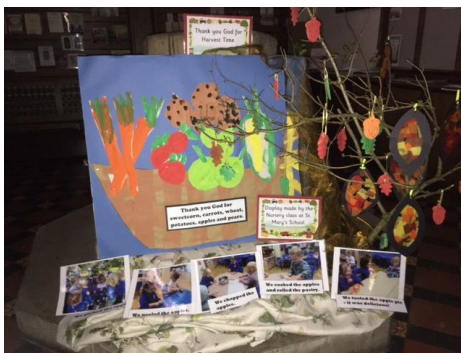
display in church for Harvest.

A huge, huge thank you to all who so generously supported our Harvest appeal. We really want to express practically, our value of responsibility. During harvest week we have looked at being responsible for those less fortunate and this was a superb example of supporting others. We will be taking the food this week. Any more donations are welcome. Thank you also to our Nursery class who produced a superb